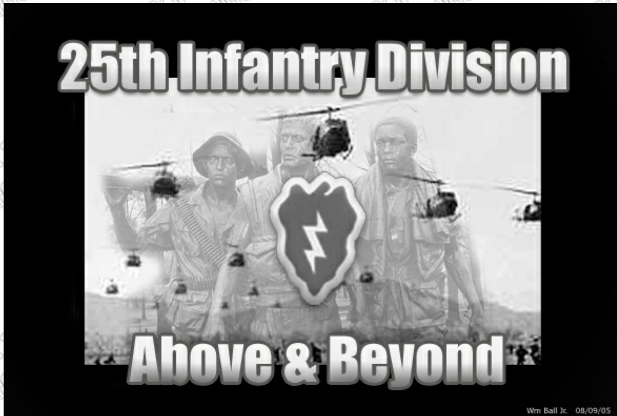
The above graphic by Wm Ball Jr.

As of the current Census taken during August, 2000, the surviving U.S. Vietnam Veteran population estimate is: 1,002,511. This is hard to believe, losing nearly 711,000 between '95 and '00. That's 390 per day. During this Census count, the number of Americans falsely claiming to have served in-country is: 13,853,027. By this census, FOUR OUT OF FIVE WHO CLAIM TO BE Vietnam vets are not.